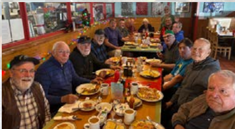
Recyclers enjoying friendship and breakfast

I thank all those who assist us on Monday Morning Recycling. It is greatly appreciated and makes our program a success.