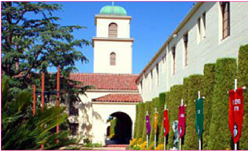
HALLOWED GROUNDS: Mater Dolorosa Retreat House in Sierra Madre.