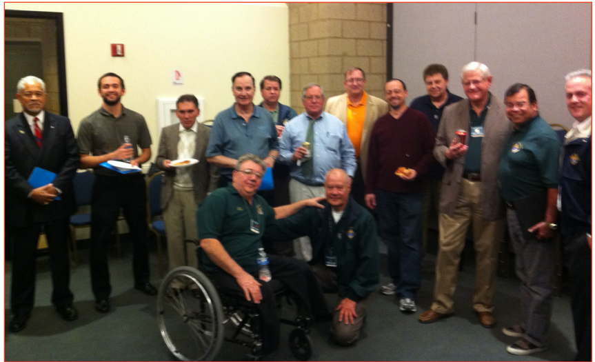
NEW FIRST degree Knights and sideliners gathered Feb. 9 at PH.