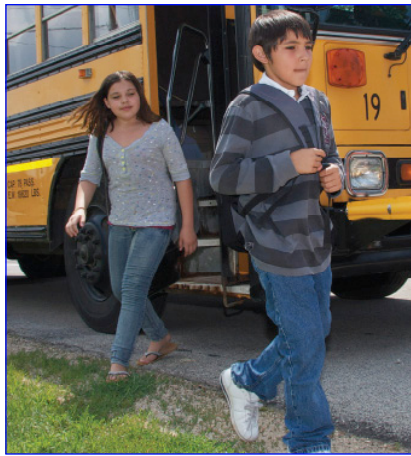
CATHOLIC SCHOOL children can get tuition assistance through KofC.