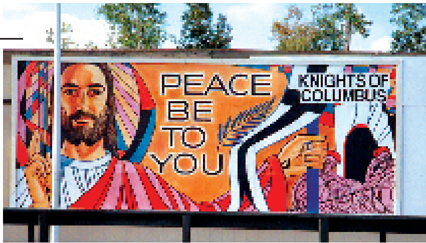
SIGN OF THE TIMES: When our Council was also in the billboard business.